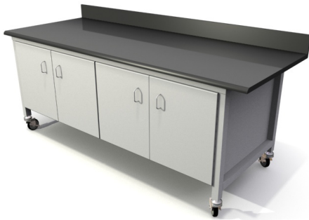
Standard Basix (available with recessed crossbar)